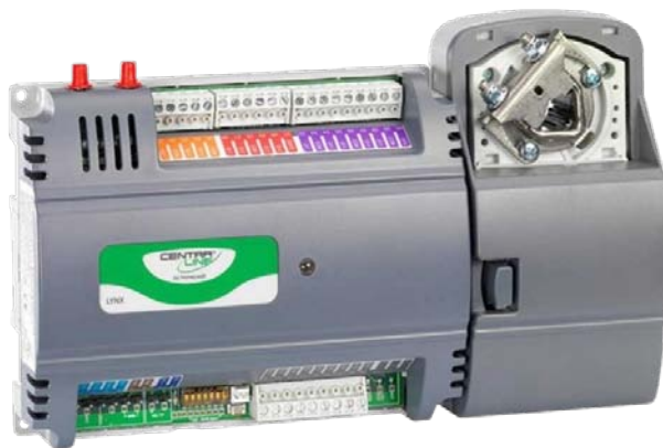
Lynx VAV Controller