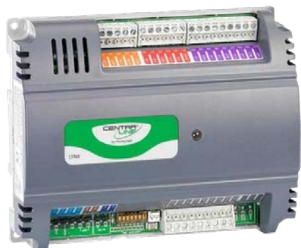
Lynx Unitary Controller

A typical wiring diagram is shown. Like the BASrouter, the Lynx controllers incorporate a 24 VAC half-wave rectified power supply meaning that the BASrouter and the Lynx controllers can share the same AC power source as long as the COM pin on the BASrouter and the 24VAC COM pin on the Lynx controllers are connected together as shown. If separate power sources are used then an earth connection must be shared by the COM and 24VAC COM pins. The BASrouter requires about 4 VA of power while Lynx controller consumption varies with the model. Verify that adequate power is available when sharing a transformer. Notice the grounding requirements in the wiring diagram.