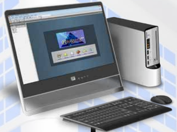
AX Supervisor Network Server

Using Niagara WorkPlace AX, a systems integrator can configure and commission Niagara building controllers, operator workstations and Sedona Framework ™ field controllers — creating a building automation system that can be scaled for small, medium and large buildings.