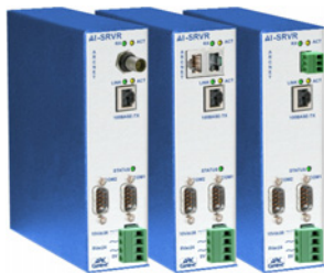
The AI-SRVR is designed with many additional features including 256 separate ARCNET receive buffer mailboxes, a resident web server that provides status information, and a DLL for Windows 2K/XP clients that is given to facilitate communication.

Customers frequently ask us to route messages between ARCNET and Ethernet networks, however, there is no standardized method to accomplish this task. That's why Contemporary Controls has designed a connectivity device that solves the problem of allowing data to pass between ARCNET and Ethernet networks.