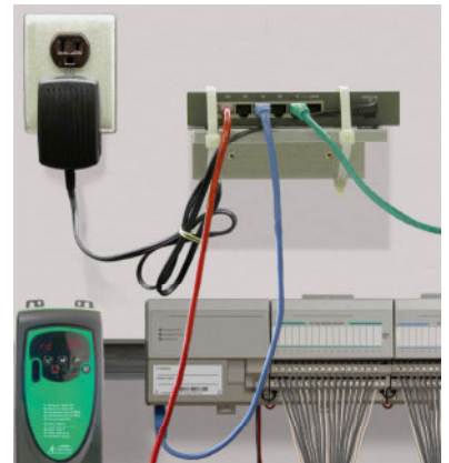
This installation is functionally correct, but it is a messy solution prone to mishap.

CTRLink equipment is wide-range, low-voltage AC or DC powered, allowing the same equipment to operate worldwide. For safety purposes, most control panels function from either 24V AC or DC sources so it is simple to power the CTRLink switch from the same source as the other control equipment in the panel.