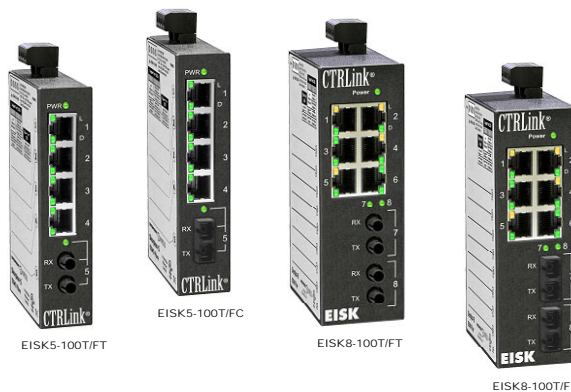
The Skorpion fiber series also includes the EISK5-100T/FC and the EISK8-100T/FC, which support single-mode cable.

The rugged Skorpion 5- and 8-port fiber series provides reliable connectivity for industrial and building automation systems in a cost-effective manner, backed by a 5-year warranty. Fiber ports are used when distances exceed the 100 meter limit of copper, when immunity to EMI/RFI is important or for additional communication security. ST or SC connectors are available for use with (1300 nm) multimode fiber cable or SC connectors with single-mode (1300 nm) fiber cable. All fiber ports operate at 100 Mbps full-duplex.