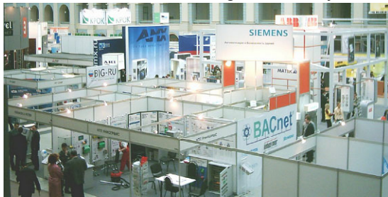
Hi-Tech House is an international exhibition of the advanced technologies' achievements applied in commercial and residential markets.

This was the fifth year that the show, "Hi-Tech House 2006," had been staged in Moscow (just across the road from the Kremlin), and took place from the 9th to the 12th of November. The show addresses the rapidly-growing market for Building Automation products in Russia, specifically in the area of domestic dwellings. The three main networking technologies for this sector—BACnet®, LON, and KNX—were each represented by their respective local Groups. Exhibiting companies included such well-known names as Johnson Controls/York, Honeywell, Automated Logic, TAC, Trend, Siemens, ABB, Wago and many others.