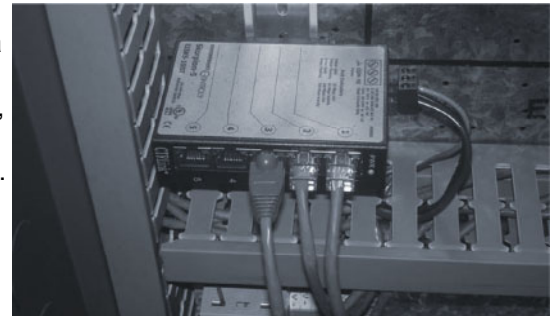
The photo shows the Skorpion 5 positioned in one angle in the control panel of a fan system. The switch is mounted among the other components such as the System Controller.

Garcia said the well-engineered system exceeded the expectations of the school officials; a system that was designed with the Contemporary Controls product backed by excellent technical assistance.