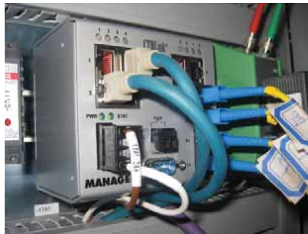
The EISX8M-100T/FCS is a highly compact Ethernet switch. The fiber ring connections are shown on the right.

The Contemporary Controls' EISX compact managed Ethernet switching hub met the needs of the project because of its outdoor temperature rating, its enhanced