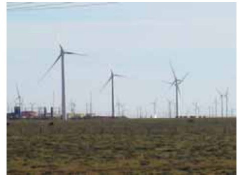
Up to 1,000 towers can occupy one wind farm.

On a wind farm, each wind tower has a 1.5 MW turbine and controls at the top of the tower, and additional controls at the base of the tower. Up to 1000 towers can occupy one wind farm. These towers communicate with a central control room over single-mode fiber optic cable in a ring topology. If the ring is broken at any one point, communication is not impacted due to the redundant path inherent in a ring topology. Situated in an outdoor environment, all the controls and Ethernet equipment must be able to tolerate extreme temperatures, lightning strikes, and potential electrical interference from high power turbines. Because the job site is so remote, the reliability of the equipment is a major concern.