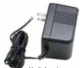
North American transformer shown